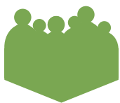
STUDENTS TO RECENT ALUMNI