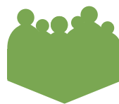
STUDENTS TO EXPERIENCED PROFESSIONALS